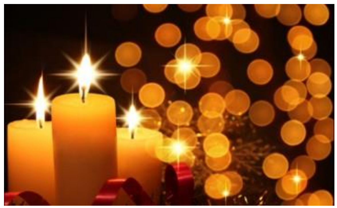
Holiday Greetings from the Bay Area Hearing Voices Network

Since 2016 the Bay Area Hearing Voices Network has been offering supportive adult hearing voices groups for voice hearers and those with unusual experiences and for family and friends of voice hearers.